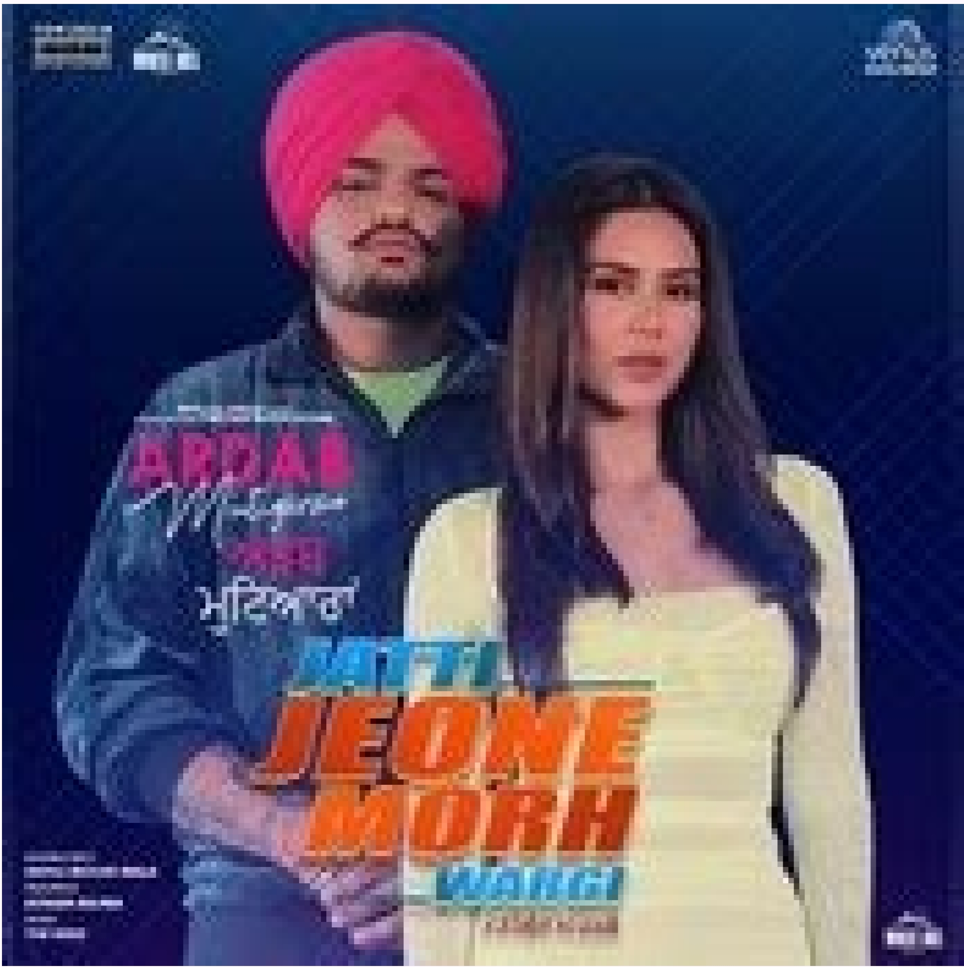
Chosen song whatsapp status video download. Chosen song status video download.